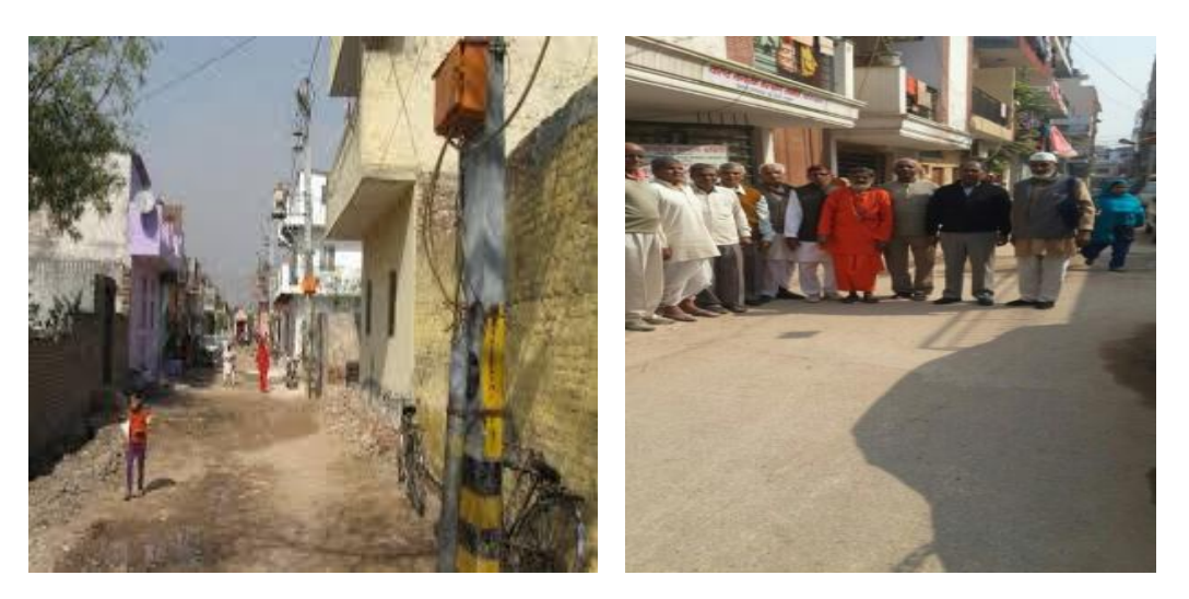
Figure 1 Chattarpur Extension: 2012

Inputs of such meetings are discussed carefully and presented to the local government representative. In this way there is participation of the elders in voicing their opinion regarding their community.