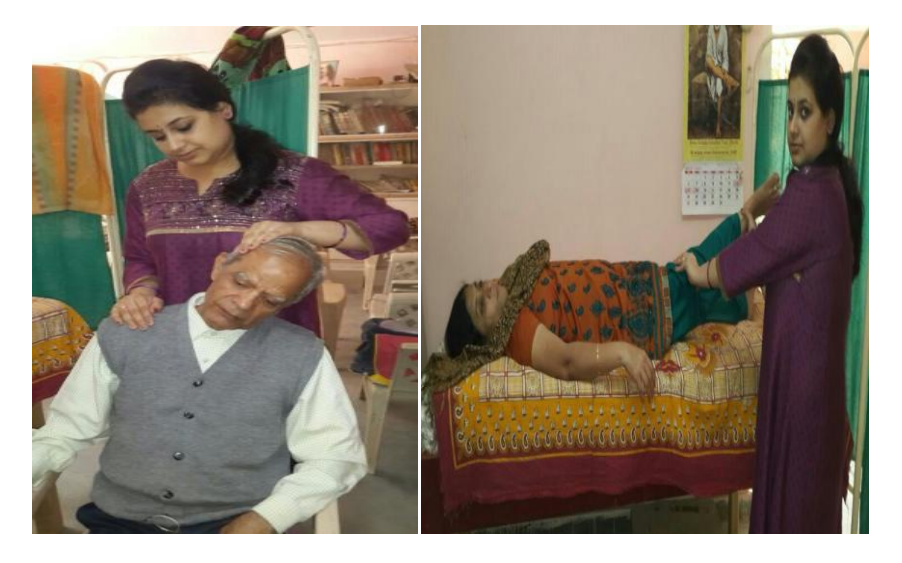
Figure 3 Physiotherapy Clinic at VNKS: February 2012